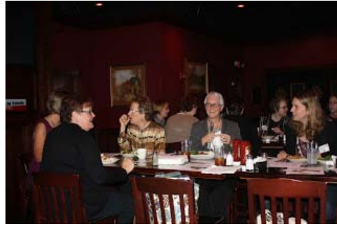
Guild members enjoy a tasty buffet lunch at the October 20 meeting, held at Bailey's Sports Grille, Arlington.